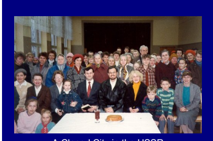
A Closed City in the USSR First Communion Service

One Thousand Churches in the former Soviet Union: We moved to the Soviet Union when it was the Soviet Union and immediately began to train pastors, evangelize and start new churches. As a direct result of our ministry, one new church in the former Soviet Union has been established every week for more than twenty years. Today these churches reach from the far ends of Siberia, to the Muslim "Stans" of Central Asia, to the shores of the Baltic Sea, Ukraine and into Poland, France, Belgium and Germany.