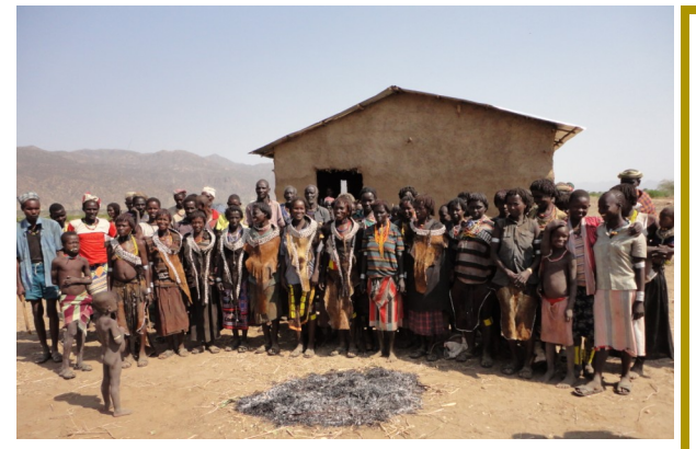
New Church Established in Omo Valley

Ancient Tribes of the Omo Valley: Home to some of the most fascinating people in Africa, we have established another new church in a land where the only previous religious practice was witchcraft and tribal deities. In this remote region close to the borders of Ethiopia and Sudan, there are no permanent structures. With virtually no shade, it is important that we establish each new church with a building so the people have a place to meet.