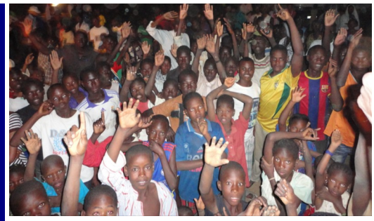
Hundreds of Muslims Saved Every Night

I slamic Country Crusade: During a night crusade, a band of Islamic thugs began to make threats. As the gospel was preached, several of the thugs came forward to listen to the message rather than continue their threats. As radical Islam increases throughout Northern Africa, Christianity is the solution for nations, and, to each individual. New church are established following every crusade.