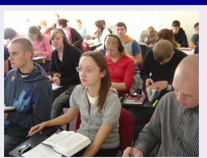
Students of New Bible School A new generation of leaders